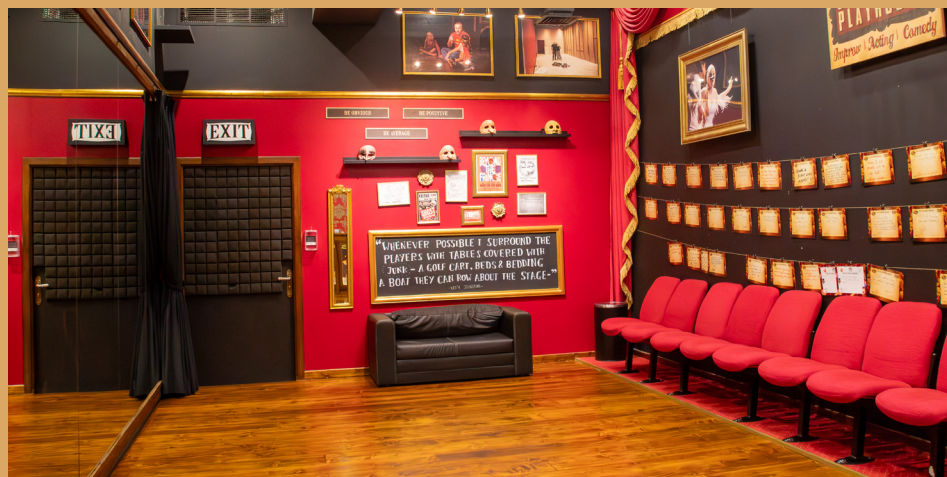
KEITH JOHNSTONE STUDIO